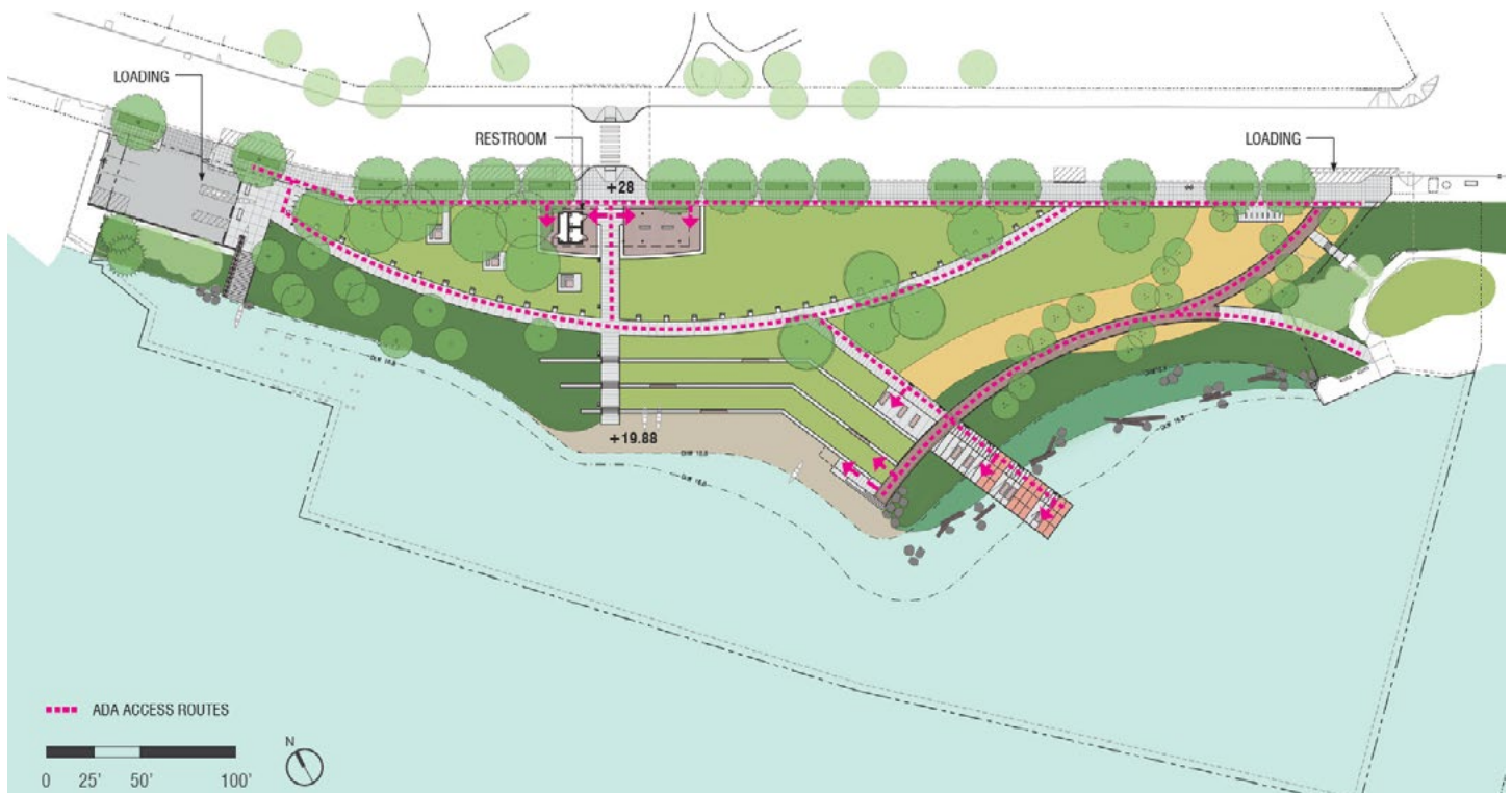
Figure 2: ADA accessibility