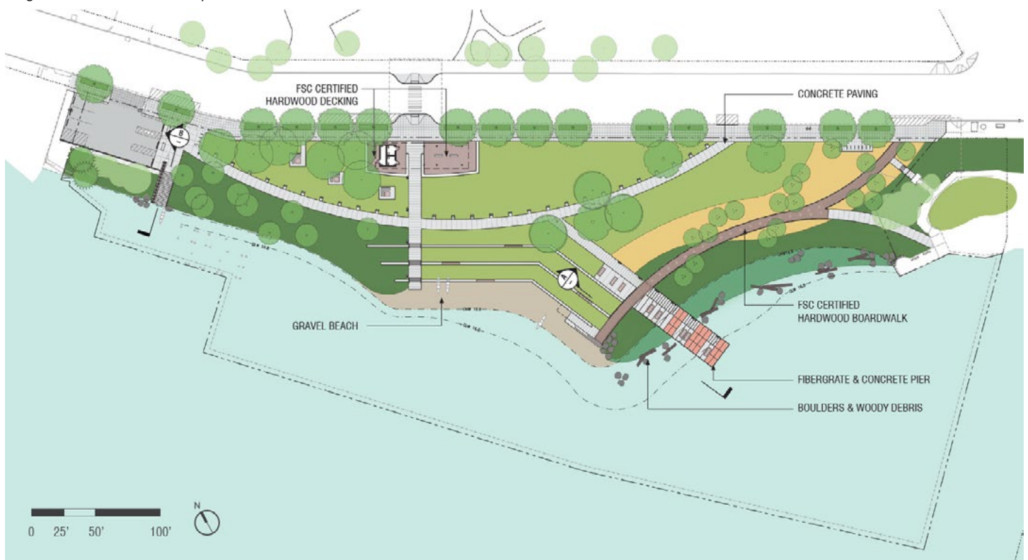
Figure 3: Proposed materials

a gateway for the park and will provide a weather protected meeting space for users. The post and beam structure, designed to appear as if it is floating, will be constructed out of steel beams and columns and will include a curvilinear rib pattern constructed out of wood on the underside of the roof. The roof will include glass weather protection as well as a building-integrated photovoltaic cells (BIPV) if budget permits. The pavilion will include all gender restrooms, two swings, and a gathering area. See figure 4 for more detail.