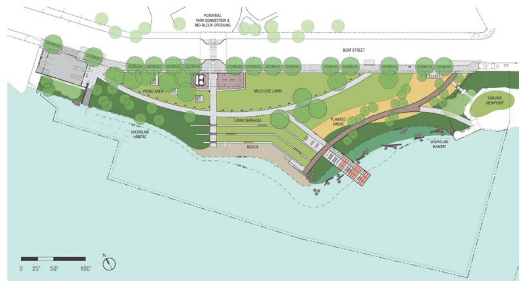
Figure 1: Previous design (top) and current design (bottom) proposals